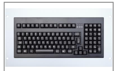
DS104W 19 Zoll-6HE